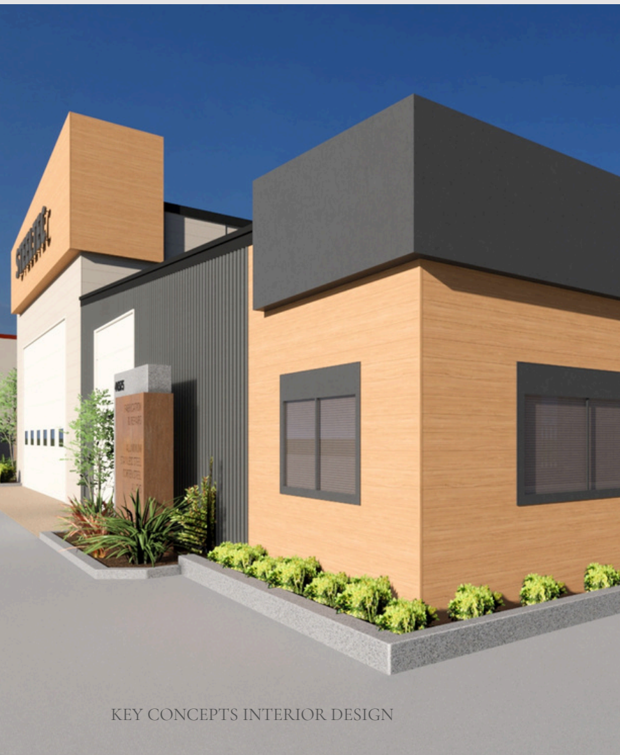
KEY CONCEPTS INTERIOR DESIGN