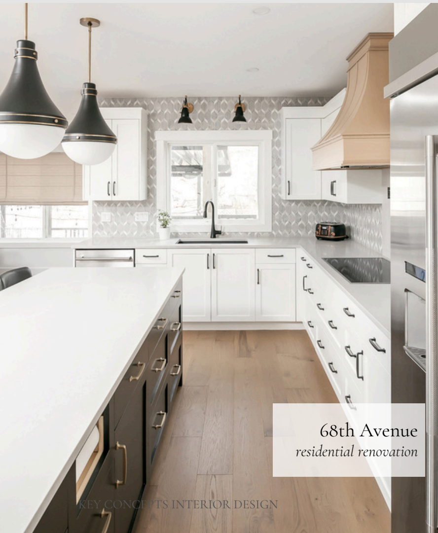
68th Avenue residential renovation