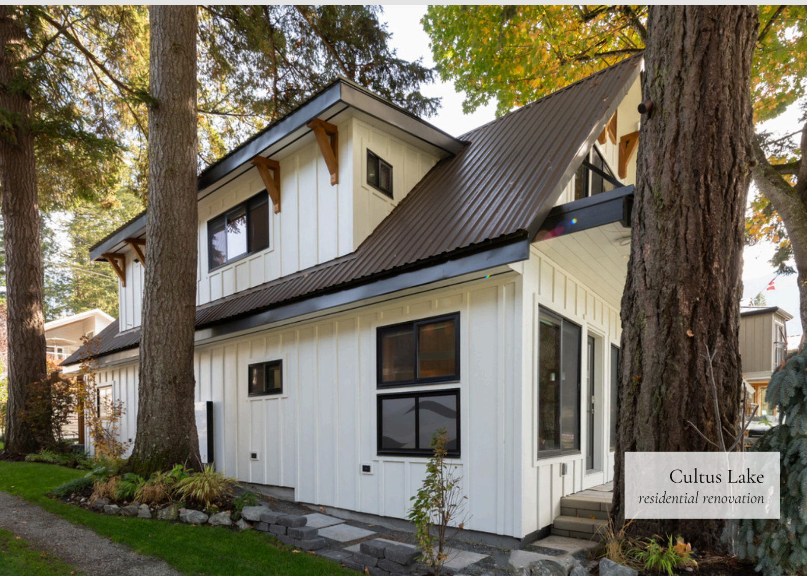
Cultus Lake residential renovation

Based in the Fraser Valley with clients throughout the province, KCID has been creating inspiring spaces for more than 30 years. We strive to forge deep connections with our clients, so that we can gain a true understanding of your unique needs and bring your dreams to life.