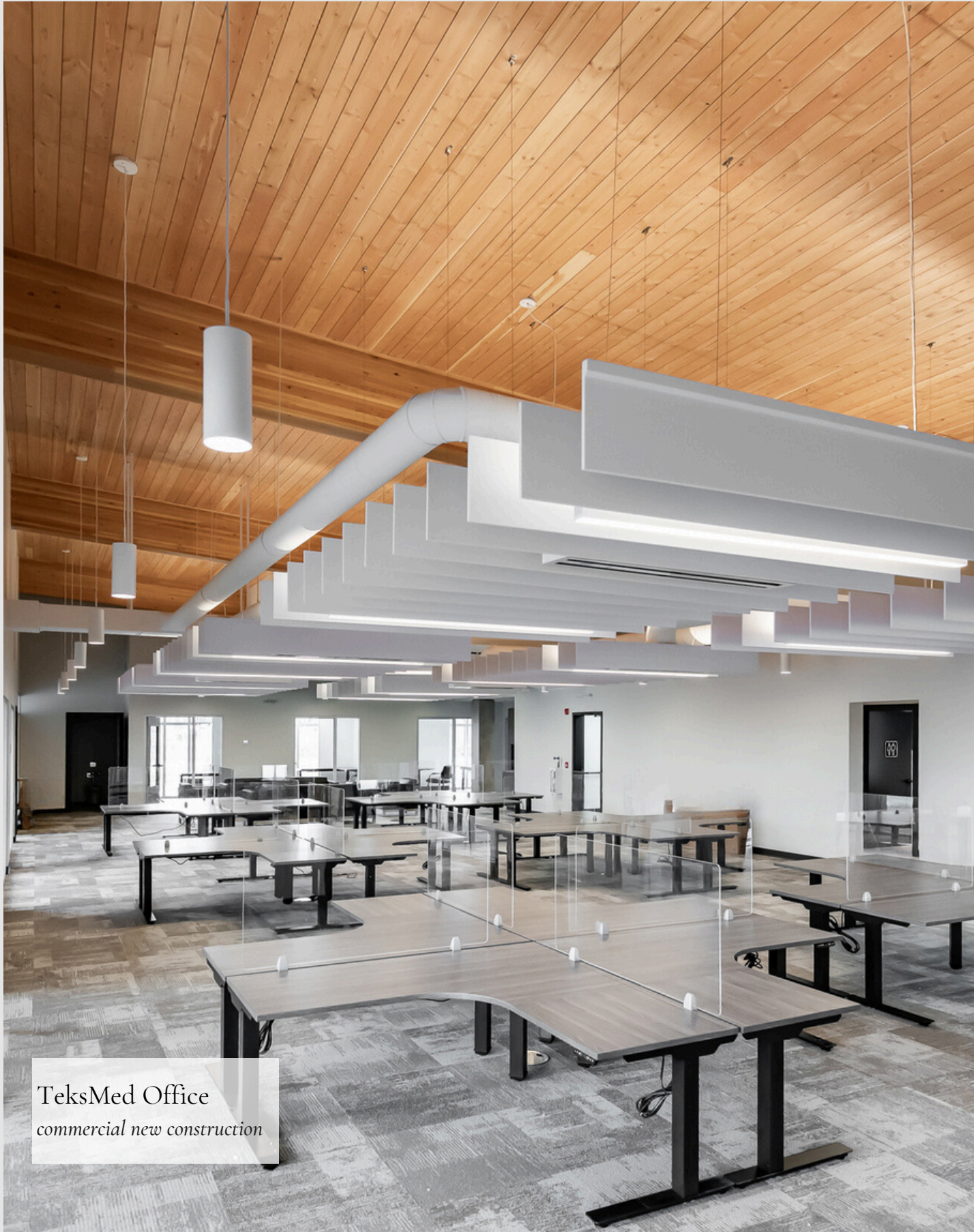
TeksMed Office commercial new construction