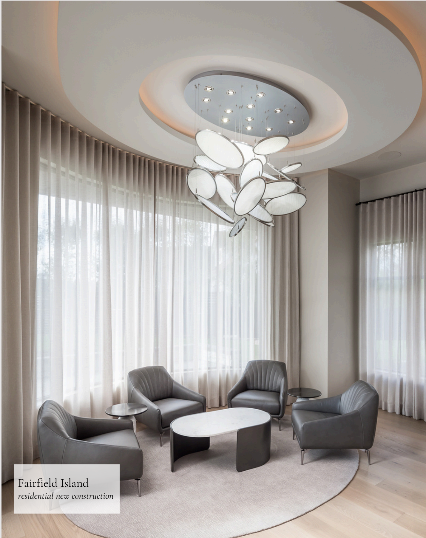
Fairfield Island residential new construction