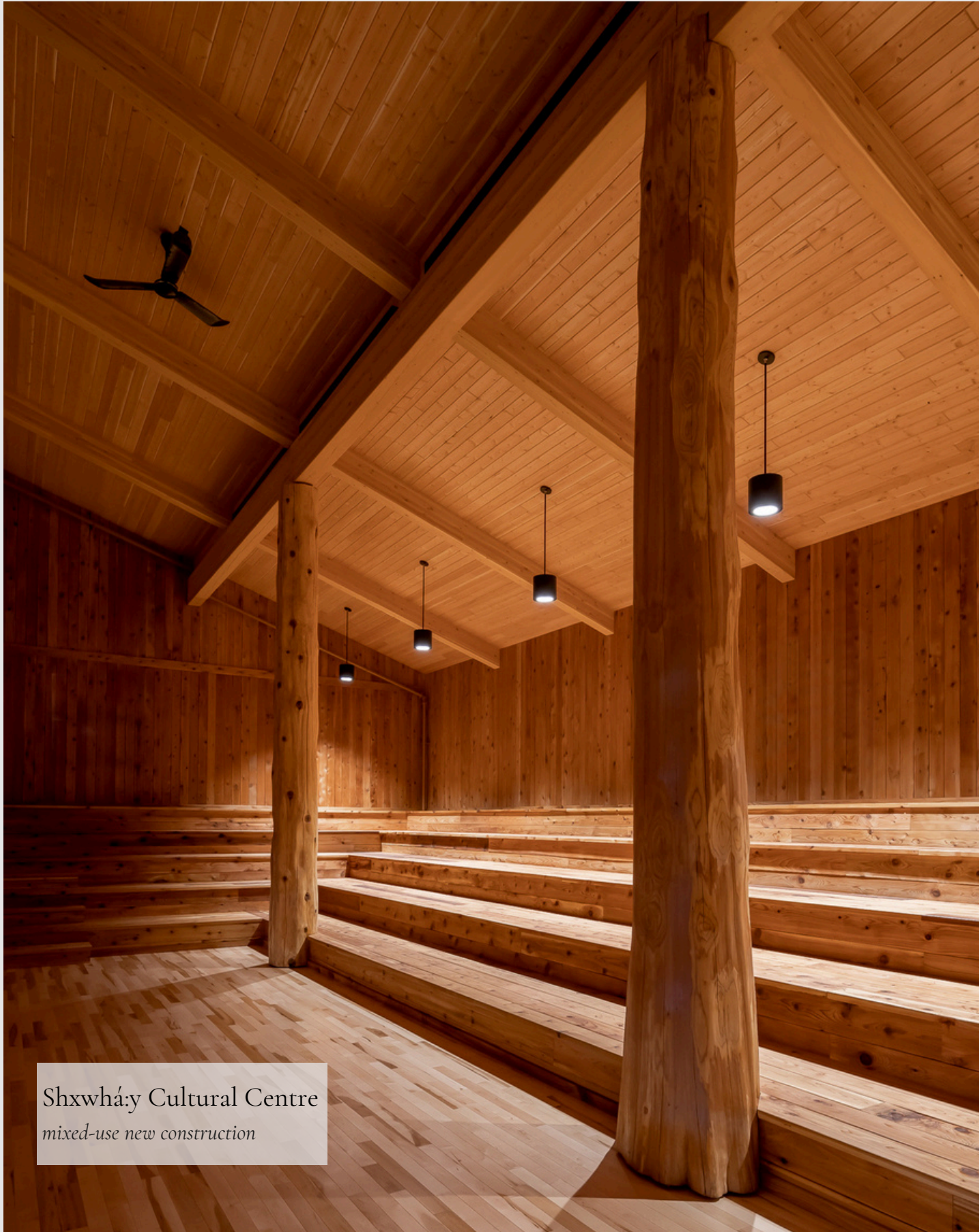
Shxwhá:y Cultural Centre mixed-use new construction